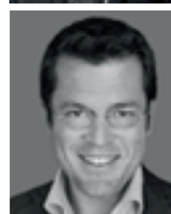
Baron Karl-Theodor von und zu Guttenberg