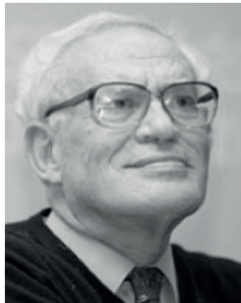
Prof. Charles Goodhart

Prof. Charles Goodhart is Director of the Financial Regulation Research Programme at the LSE. He is the developer of Goodhart's law, an economic law. He served at the Bank of England and was member of its Monetary Policy Committee from June 1997 to May 2000. He has published extensively in high-ranking economics journals.