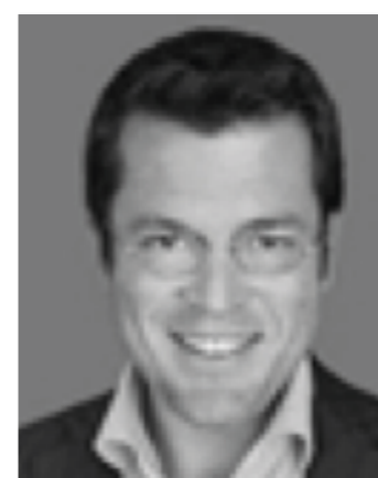
Baron Karl-Theodor von und zu Guttenberg