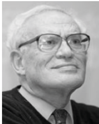
Prof. Charles Goodhart

Prof. Charles Goodhart is Director of the Financial Regulation Research Programme at the LSE. He is the developer of Goodhart's law, an economic law. He served at the Bank of England and was member of its Monetary Policy Committee from June 1997 to May 2000. He has published extensively in high-ranking economics journals.